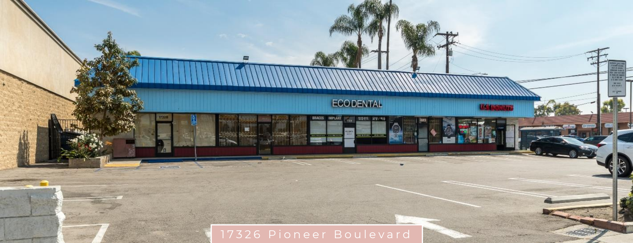
17326 Pioneer Boulevard