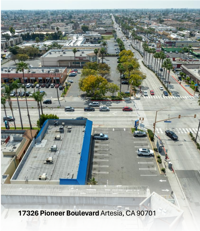
17326 Pioneer Boulevard Artesia, CA 90701